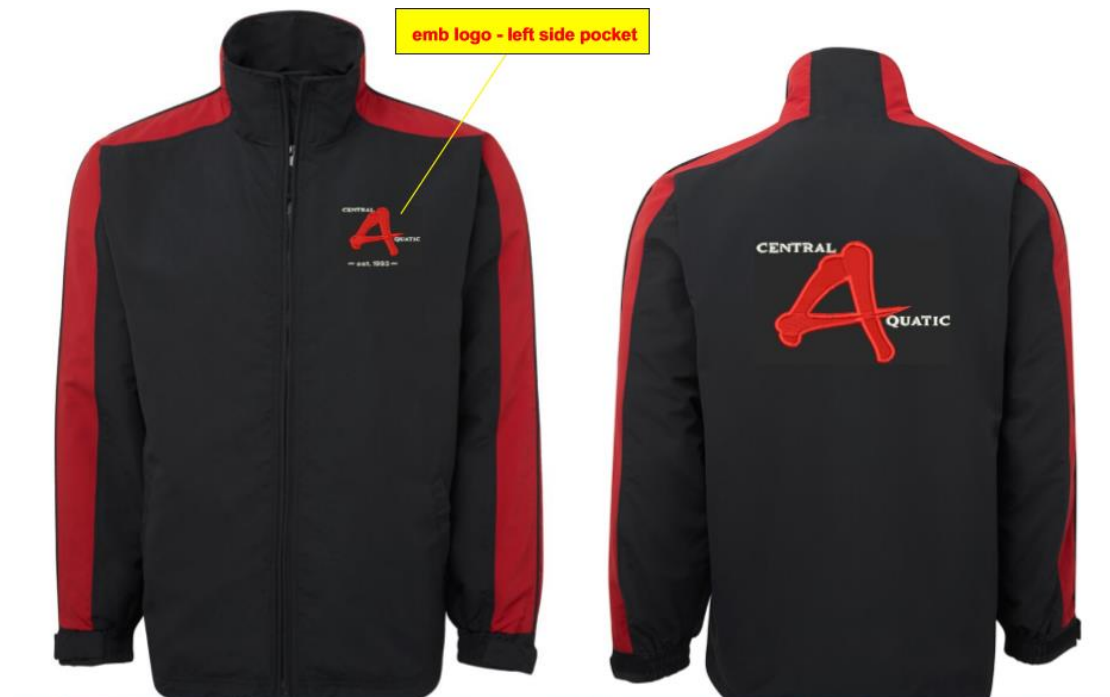
Emb LHB LOGO